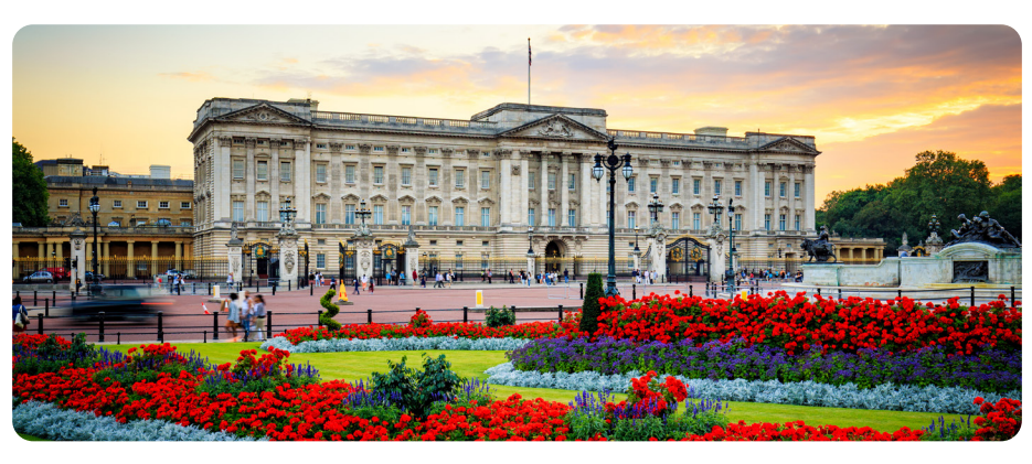
Buckingham Palace is in London, England. It is the Queen's main residence.

Royal residences include palaces, castles and stately homes. Some of them are used for official royal business and some are used as holiday or private homes.