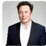
Elon Musk is trying to make a rocket to go to Mars.

A year is 365 days. A decade is 10 years. A century is 100 years.