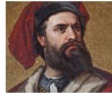
Marco Polo explored Asia