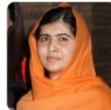
Malala Yousafzai campaigns for girls to have the right to go to school.