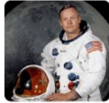
Neil Armstrong was the first person to walk on the Moon.