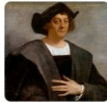
Christopher Columbus was the first European person to discover the Americas.