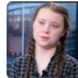
Greta Thunberg campaigns to stop climate change.