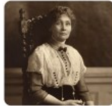
Emmeline Pankhurst stood up for women's rights.

A year is 365 days. A decade is 10 years. A century is 100 years.