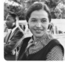
Rosa Parks wanted black people to have the same rights as white people.