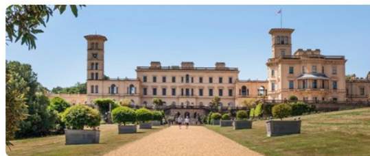
Osborne House is on the Isle of Wight, England. This was Queen Victoria's favourite holiday home.