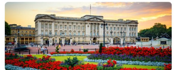
Buckingham Palace is in London, England. It was Queen Elizabeth's main residence.